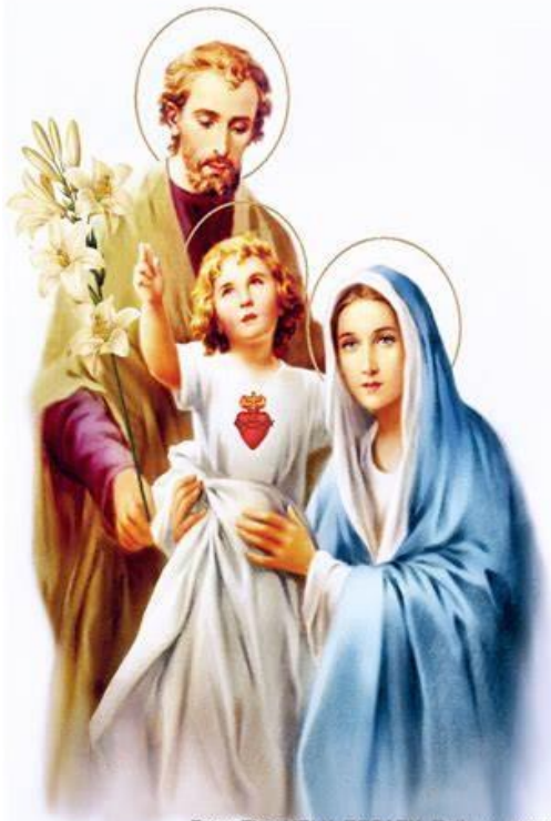
Pray The HOLY ROSARY Daily

The Marian Centre would like to extend our thanks to all who have contributed towards their need of men's clothing in the past months. Our clothing room is now well supplied with men's winter clothing, which we share with those who come to us in need. We request at this time that further donations of clothing be suspended until April 1 st . Again, thank You!